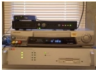
e-tv server, VHS back-up and teletext inserter at studio in Aberfeldy (smaller box on top is router)

Programmes were encoded onto an inexpensive server and played out on a schedule that (like Dundee) could be overwritten by premium rate phone requests from the hotel or bunkhouse. Leaflets were left in the hotel providing instructions and listing the videos available on the server. The schedule would stay the same for three-four weeks and local programmes would be interspersed with fresh archive footage.